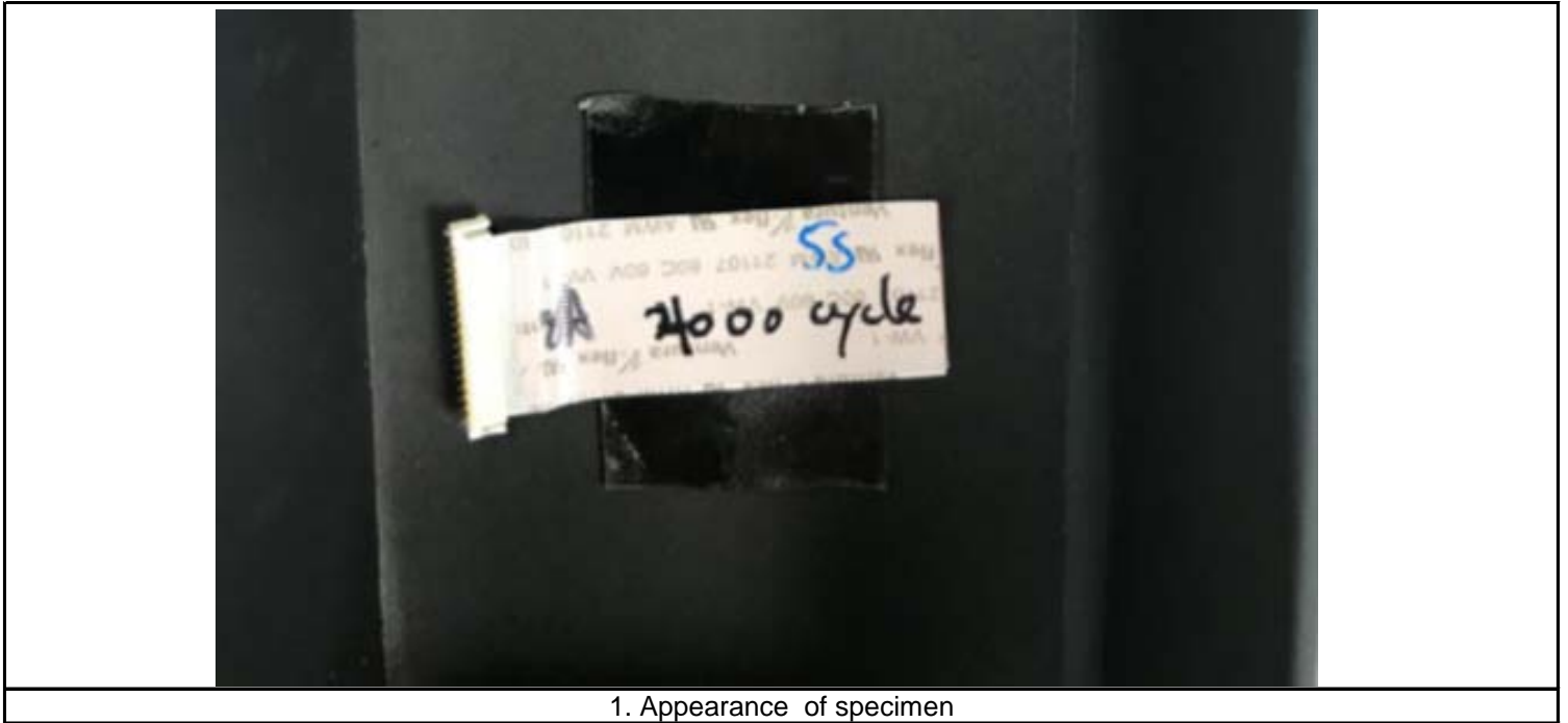
1. Appearance of specimen

This document is issued by the Company under its General Conditions of Service accessible at www.sgs.com/terms_and_conditions.htm and, for electronic format documents, subject to Terms and Conditions for Electronic Documents at www.sgs.com/terms_e-document.htm . Attention is drawn to the limitation of liability, indemnification and jurisdiction issues defined therein. Any holder of this document is advised that information contained hereon reflects the Company's findings at the time of its intervention only and within the limits of Client's instructions, if any. The Company's sole responsibility is to its Client and this document does not exonerate parties to a transaction from exercising all their rights and obligations under the transaction documents. Any unauthorized alteration, forgery or falsification of the content or appearance of this document is unlawful and offenders may be prosecuted to the fullest extent of the law. Unless otherwise stated the results shown in this test report refer only to the sample(s) tested and such sample(s) are retained for 30 days only. This document cannot be reproduced except in full, without prior approval of the Company.